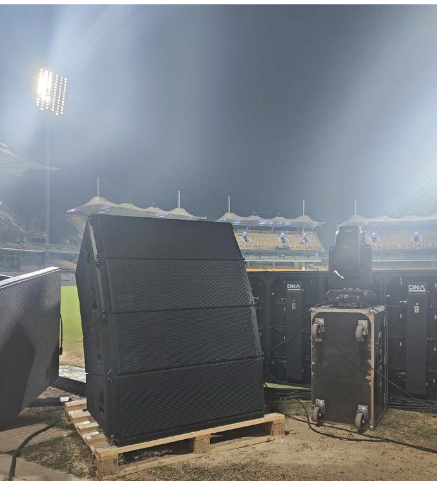
Reynold's Sound & Lightig Services' team equipped the venue with audio equipment from d&b audiotechnik, Meyer Sound, Sennheiser, Shure, and DiGiCo

& Lighting Services stepped up to the task of executing the Opening Ceremony's acoustic and visual ambience to perfection. PALM Expo Magazine, in a conversation with Reynold's Sound & Lighting Services' team, explores how India's biggest cricket league delivered an unforgettable opening ceremony.