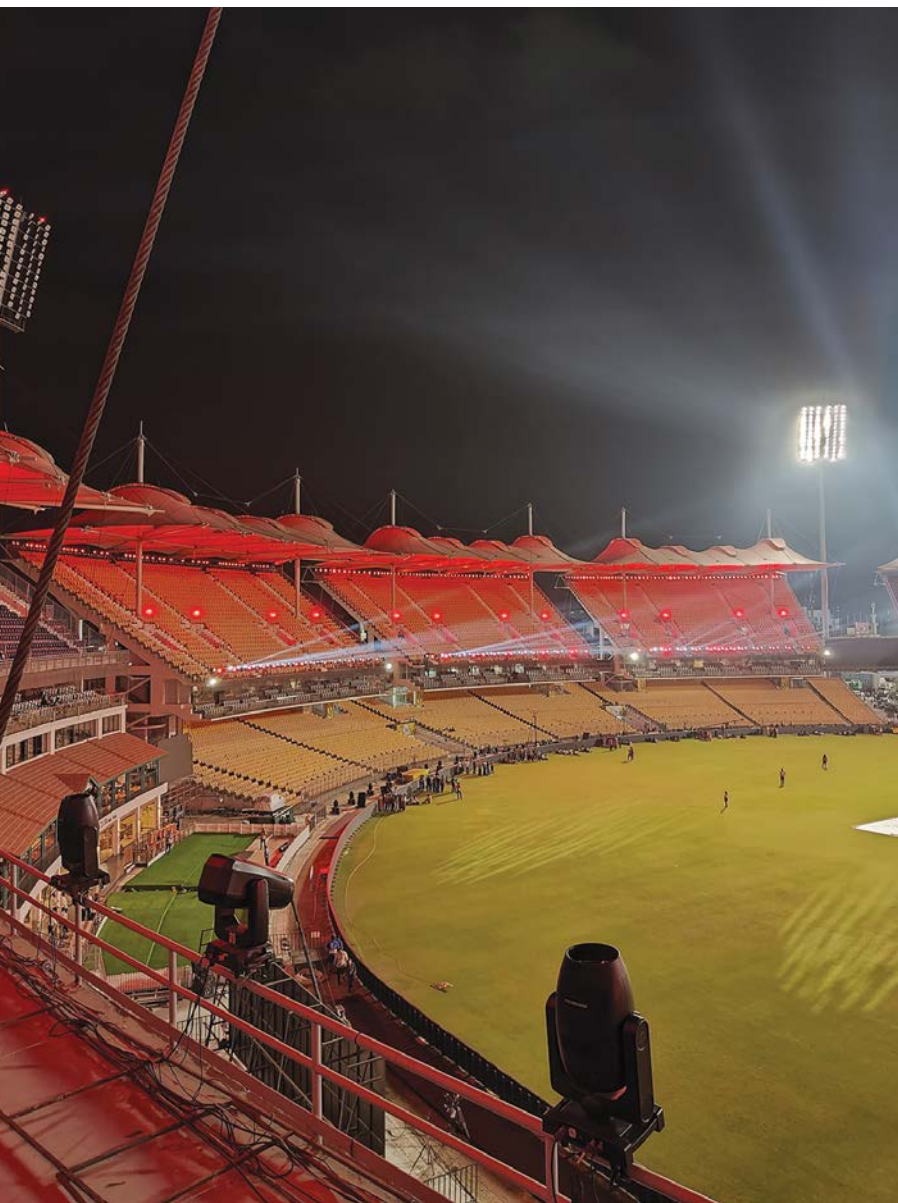
The lighting for the performance stage was designed to have a combination of a floor package and only essential fixtures mounted on T-trusses

the event ensured the fans got a great auditory experience. The deployment of the subwoofer array was such that low-frequency energy was steered away from the FoP and towards the galleries, ensuring the players weren't disturbed and the fans had a blast.