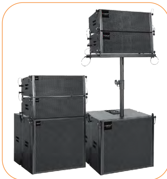
Clarion JM-KAL 265

Clarion is set to unveil a dynamic lineup of audio innovations at the upcoming Expo, including the JM KAL 265 and JM KAL