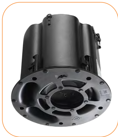
4 Square Corporation JBL Control 400 Series

At 4 Square Corporation's booth, visitors will be witnessing the launch of the JBL Control 400 Enhanced Coverage Series , successor to the iconic Control 20 Series, offering improved coverage, superior sound, easier installation, CRBI™ baffle design and support for both 70V/100V and low impedance systems.