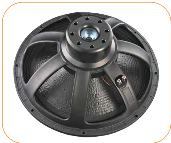
Decibel Pro Celestion-Ten-Squared

245, premium birch plywood acoustics solutions pairing active subwoofers (15" and 12") with passive dual speakers (6.5" and 4.5"). Designed for versatile