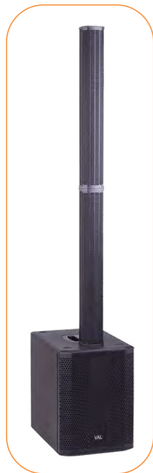
Celto Acoustique LLP VAL Audio X-Line 12

POPE Professional is unveiling its own line of audio products at the Expo, starting with the new IC Series subwoofers , designed for high-impact bass with low distortion in a compact form. Using an isobaric configuration of long-excursion 18-inch ferrite transducers (two in the IC-218B, four in the IC-418B), the system delivers clean, deep low-end energy from 25 Hz to 300 Hz. With built-in handles (IC-218B) and rear casters (IC-418B), the series is engineered for easy transport and reliable performance across touring, fixed installs, theatres, houses of worship, and large venues. To power these subs,