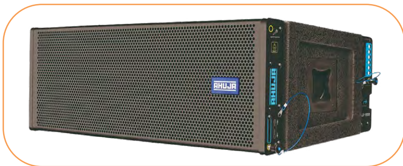
Ahuja Radios ALX-15000

Ahuja Radios will be launching ALX-15000 an attractive and rugged Line Array Loudspeaker. The system features a power rating of 1200W RMS and is