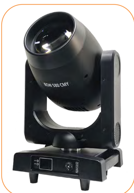
Davdajis LongLife Beam 550 Prism King

Imax Lighting will be launching a variety of new products. The Marvel 440 BSW is a new generation professional and intelligent compact LAMP BSW moving head light designed with a full CMY color mixing system, smooth and linear zoom from 4°-32°. The Marvel 440 beam is an ultra compact and light weight stylish moving head beam light with an OSRAM SIRIUS HRI 420W lamp, integrated with a set of unique high resolution