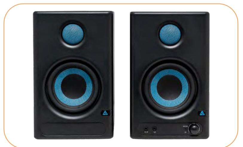
AM-S1 - Studio monitor speakers

Cambium Retail will unveil the AM-S1 studio monitors , featuring a 4" woofer, 1" tweeter, 60W Class D power, and versatile I/O for pro-grade clarity, custom tuning, and all-device connectivity. They will also introduce the SB-01 soundbar , delivering 16W of immersive sound with dual bass drivers, Blue-