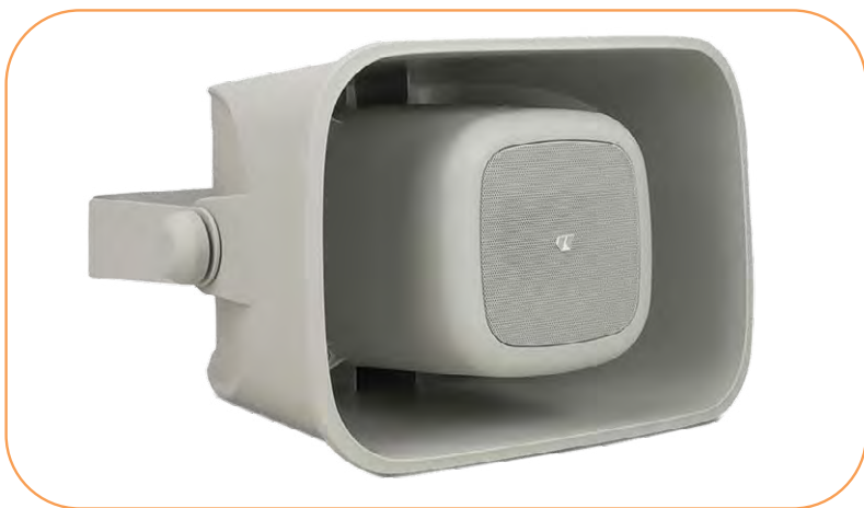
Workpro MSH 60

Pink Noise Professionals is debuting several international pro audio and AV products in India at this year's Expo. The Symphony Studio Series by Apogee includes high-performance USB-C interfaces with Apogee AD/DA conversion, 75dB gain preamps, Room EQ, bass management, and support for immersive formats like Dolby Atmos. From EAW, the RSX212L, RSX218, and RSX12M deliver high-output performance with integrated Dante™ networking and EAW's OptiLogic™ for faster setup. WorkPro's NEO 5 AIR brings wireless digital audio to compact loudspeakers. The MSH 60 is an all-weather, full-range speaker