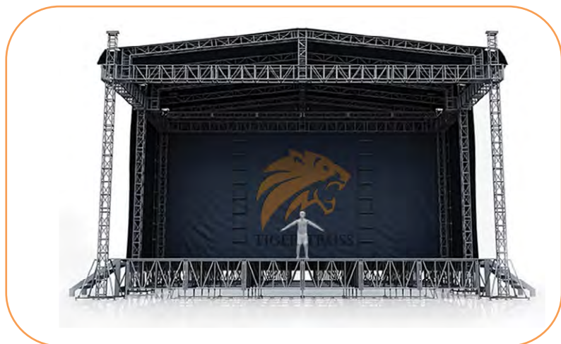
Tiger Truss' Aero Max Roof AM25

Candescant Lighting is set to launch Tiger Truss' Aero Max Roof AM25 , built on an SS40S Ground Support system with four LL40S Towers . The roof features