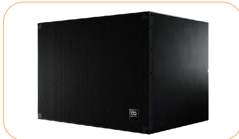
Optimal Audio SUB-18 subwoofer

From Optimal Audio, Generation AV introduces the powerful new Sub 18, expanding a subwoofer range that already includes the compact Sub 6, ideal for space-constrained installations. The intuitive ZonePad 8 controller offers touchscreen management of eight audio zones, while the Talk 8 digital pag-