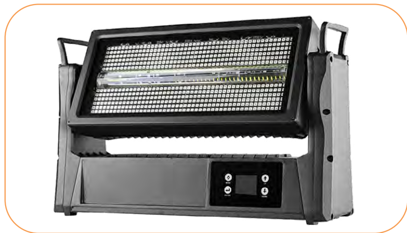
Imax Lighting FX strobe 1500 IP

optical system. The IMAX EYZ 2/300 is a rugged IP65-rated 2 × 300W RGBAWW LED fixture with advanced colour mixing, wide beam angle, silent cooling, and versatile DMX control modes. The IMAX FX STROBE 1500IP is an ultra high-power IP65-rated strobe with 144 × 5W CW LEDs and 576 × 0.6W RGB LEDs in 24 controllable segments, delivering wide-angle, high-speed strobe and dynamic tilt effects for large-scale outdoor events. The IMAX MAGIC BAR 66 is a rugged lighting bar with 6 × 60W RGBW moving heads, 360°/540° PAN,