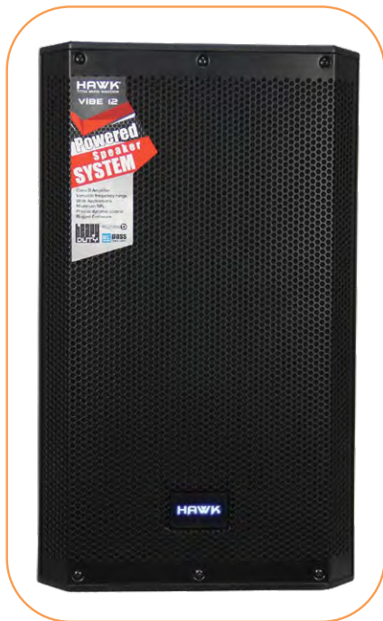
Trimac HAWK VIBE 12

pulse-pounding power to live performances. Also debuting is the WDH Wireless Mic Series , promising seamless wireless integration and crystal-clear audio.