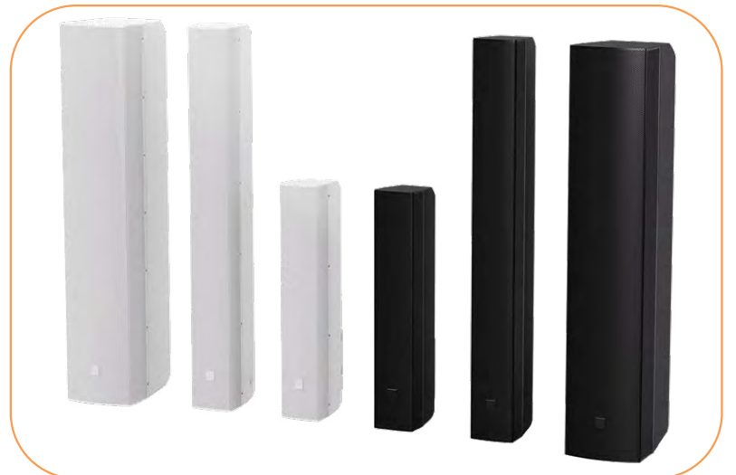
Electro-Voice's LRC series

and Dynacord , two powerhouse brands within the industry. Bosch will launch Electro-Voice's next generation of its acclaimed EVID series ceiling speakers , featuring two new series: the EVID-C-G2 and EVID-EC. These speakers cater to diverse audio needs, ranging from 3" full-range to 8" two-way configurations, including specialized models for various applications, such as high-performance and EVAC-certified options. They will also launch the EVOLVE 70 & 90 , which are the most powerful additions to the EVOLVE family yet. The three pieces system fits together in two clicks to form one system. Both the 70 & 90 are powered by a 2000 Watts Amplifier, Column Arrays feature 8x 4.7" neodymium drivers. In addition, they shall introduce Electro-Voice's LRC series ,