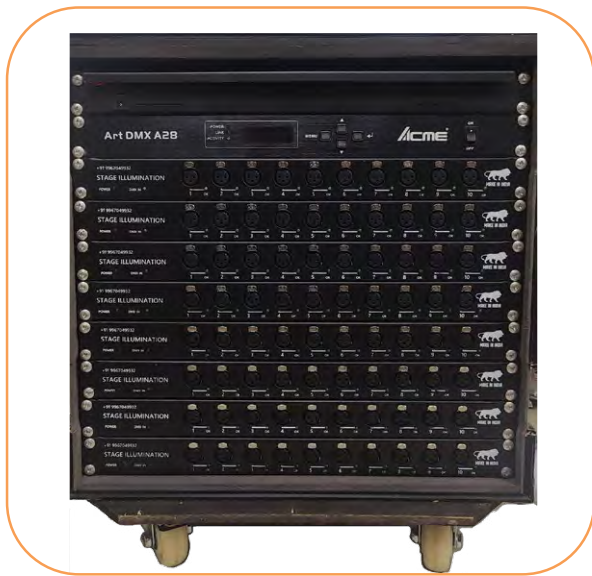
Stage Illumination 10U ARTNET TO DMX

Stage Illumination will launch the, NPF-03 and CPF-03, which are 10-output DMX splitters with 1 input, front-facing signal LEDs, Powercon, surge protection, and service-friendly IC bases for reliable indoor/outdoor use. They will also launch ABN-03 and ABC-03 A and B Model DMX splitter with 2 inputs, 10 switchable outputs, dual universe LEDs, Powercon, CAT5 splitter looping, surge protection, and service-ready IC bases. The 6U Compact ARTNET RACK comes with ACME ARTNET model A28 which has 08 dmx universes as outputs and it has ethernet port with input and thru for artnet to artnet looping using Ethernet cable.