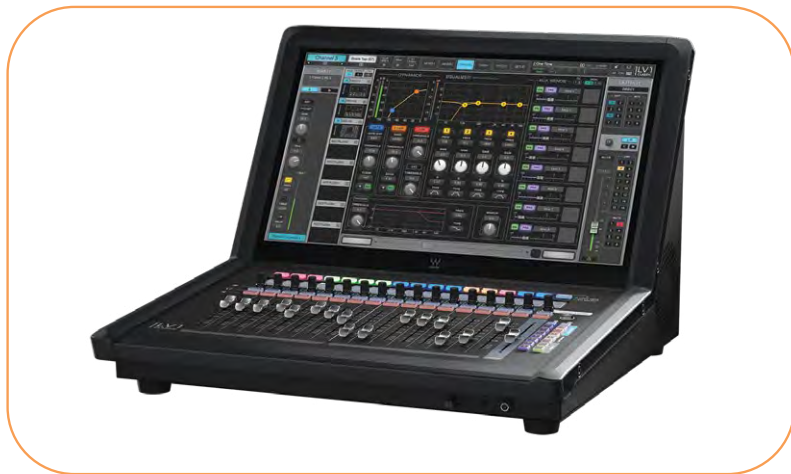
Waves eMotion LV1 Classic

Ansata , one of our exhibitors, will be showcasing several game-changers this year for the first time in India. Beginning with the Waves eMotion LV1 Classic , a compact yet powerful software-based live mixing system designed for touring engineers, broadcasters, and live sound professionals. Built to deliver studio-quality processing in a flexible and scalable setup, the LV1 Classic is powered by Waves' renowned plugins, making it a standout choice for high-performance live mixing. They are also displaying the Avid Venue E6LX-256 , the powerhouse of the E6L series, built for high-stakes live productions. With 256 channels and expanded I/O, it delivers unmatched flexibility for complex shows. Designed for seamless S6L integration, it upgrades existing setups without a hitch. Built road-ready, the E6LX-256 is engineered to handle