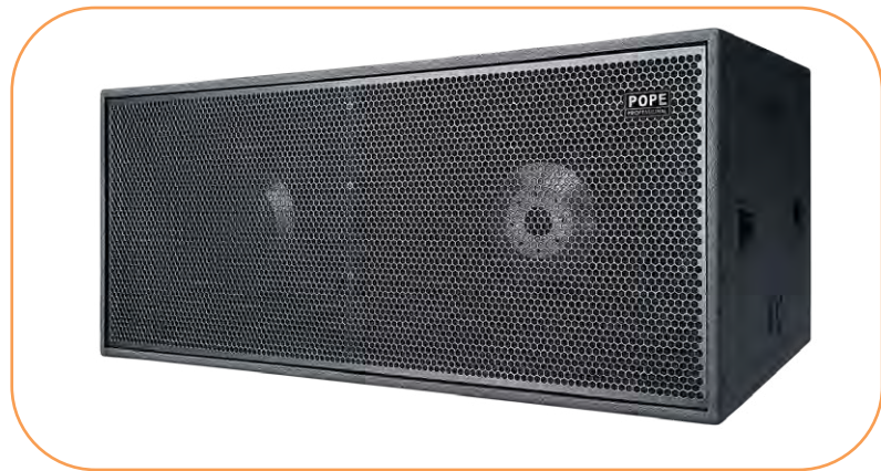
POPE Professional IC-418B

POPE Professional is unveiling its own line of audio products at the Expo, starting with the new IC Series subwoofers , designed for high-impact bass with low distortion in a compact form. Using an isobaric configuration of long-excursion 18-inch ferrite transducers (two in the IC-218B, four in the IC-418B), the system delivers clean, deep low-end energy from 25 Hz to 300 Hz. With built-in handles (IC-218B) and rear casters (IC-418B), the series is engineered for easy transport and reliable performance across touring, fixed installs, theatres, houses of worship, and large venues. To power these subs,