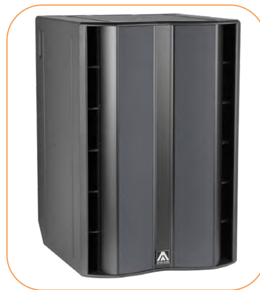
Amate Audio XW218 perspective

dual 10" LF drivers and a 3" titanium diaphragm HF driver housed in a V-shaped cabinet, the X102FD delivers 3000W of Active+ amplification with integrated DSP and Dante, achieving a remarkable 136 dB SPL continuous output. Also featured is the XA211, a next-generation dual 10" bi-amplified line array speaker boasting 3000W Class-D power, 136 dB musical program SPL (139 dB peak), neodymium components, a high-performance waveguide, touchscreen control, and robust overvoltage protection. Completing the line-up is the XW218, a high-performance dual 18" subwoofer offering 5000W amplification, F.I.R filters, integrated DSP, and cardioid presets, capable of delivering up to 144 dB SPL.