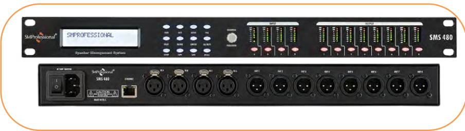
Studio Master SMS 480

Audio Plus's booth will feature Studiomaster Professional's SMS 480 Digital Speaker Management System and ADI 24.12 Digital Mixing Console to this year's Expo, being launched for the first time in India. The Studiomaster Professional ADI 24.12 is a premium 24 Channel Digital Mixing Console. Featuring multiple inputs and outputs, abundant DSP EFX