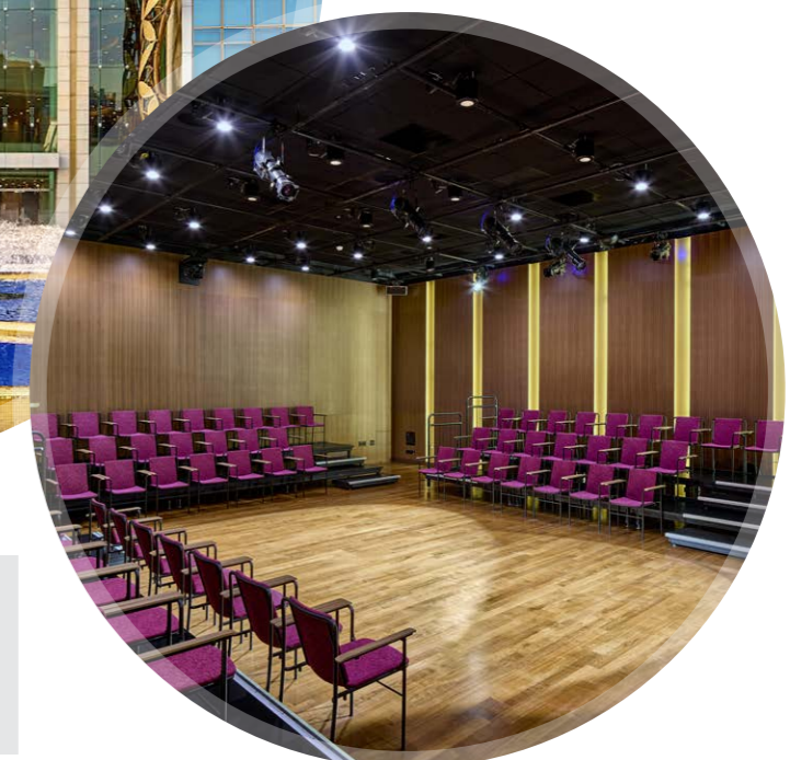
The Cube is a technologically elevated space that features a Panasonic Laser Projection System and Assisted Listening System with 5G connectivity