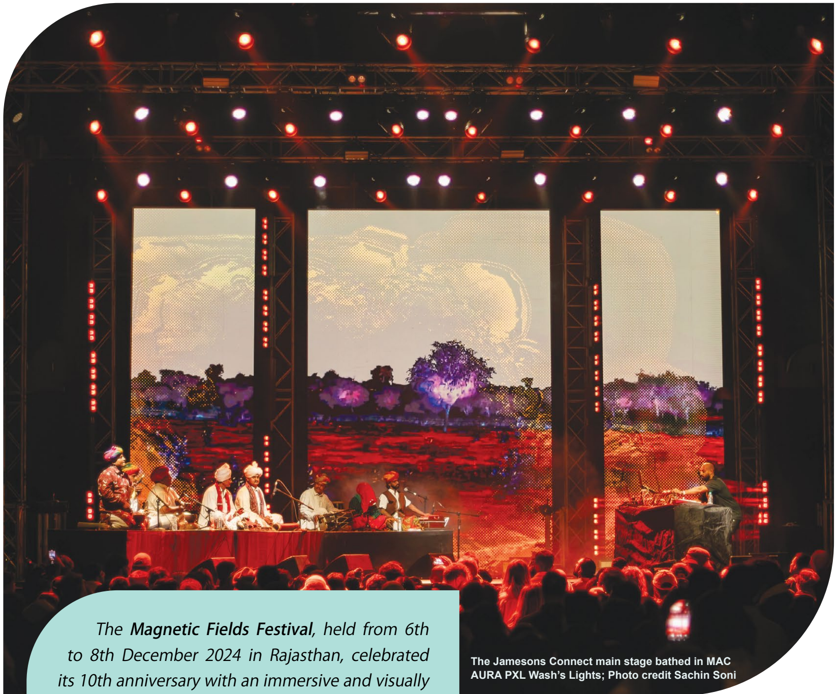
The Jamesons Connect main stage bathed in MAC AURA PXL Wash's Lights

The Role of Martin Lighting in a Decade of Musical Celebration