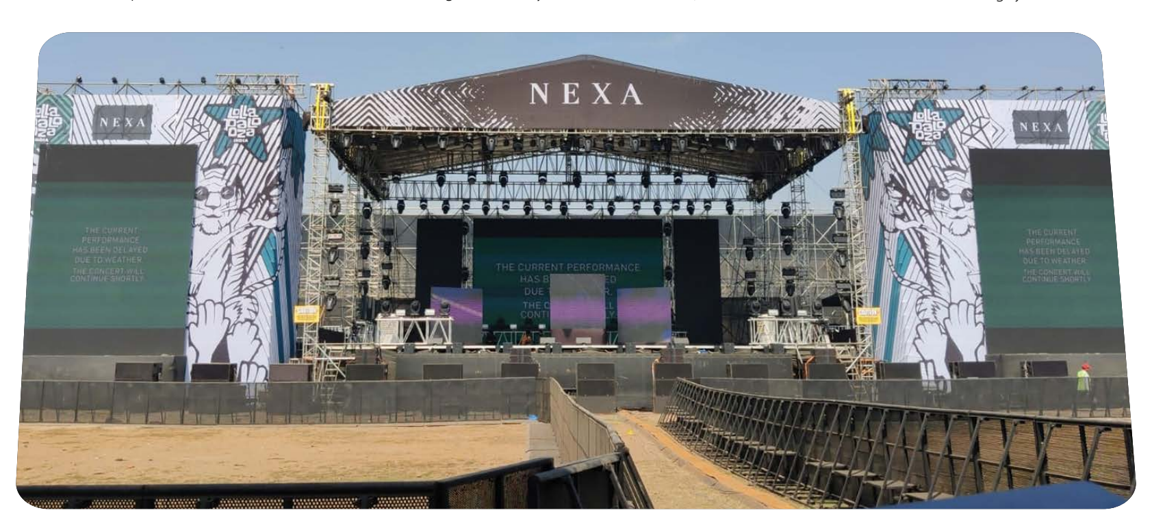
ElectroCraft (Roger Drego) deploys best-in-class pro audio solutions at the Nexa Stage with the inventory lined up by major brands L'Acoustics, DiGi-Co, Avid, Shure, Sennheiser, Pioneer DJ, and more

The Nexa Stage utilized a PA system from L-Acoustics, comprising 32 K2 main PA speakers, 40 SB28 ground-stacked subwoofers, 16 Kara out fills, 8 Kara front fills, and 12 X15 monitors. The in-ear monitoring system included