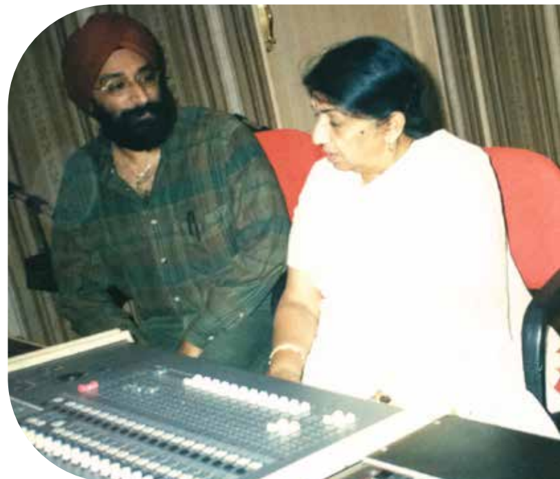
KJ with the Nightingale of India, late Lata Mangeshkar ji

As IRAA enters its 16th year, I wanted to take a step back to try and understand it in context to the music created and consumed in India. The nation has a rich legacy of aural tradi-