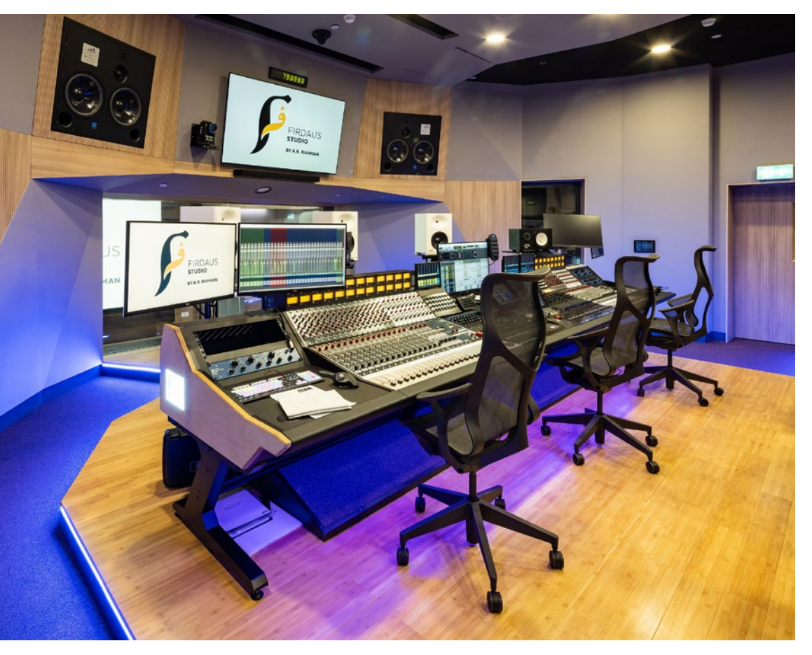
The Control Room forms the heart of the Firdaus Studio, a space fitted with cutting-edge, hybrid desk consisting of a 40-channel Neve 5088 analogue console, an Avid S6 control surface, and more

The Live Room extends beyond a recording space with its multimedia capabilities becoming a venue for events, concerts, film screenings and filming. Fitted with