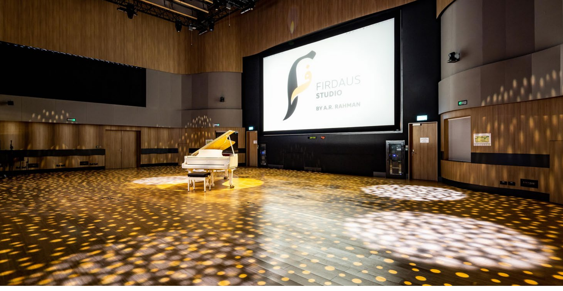
Emanating an ethereal aura, the Live Room expands into a multipurpose venue for concerts and events, elevated in form and function with microphones from Myburg, Chandler, AKG, Neumann, Sennheiser and Shure, PTZ cameras, a Christie 4K projector and a Seymour screen

seamless communication across facility and online sessions, and capture sessions for archival & posterity. The studio team comprises of skilled in-house Audio Engineers from around the world with diverse musical backgrounds, equipment mastery and precision of art.