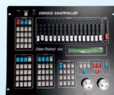
New Sunny 512