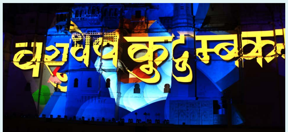
Twelve Barco UDX-4K40 projectors used alongside Dataton's Watchout software resulted in a breathtaking 3D projection mapping at the venue

As is the norm, the team at Splat Studio performed a resee of the