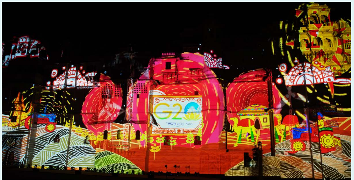
A grand start to a grand affair: Udaipur City Palace appears animated with 3D projection mapping as it opens its doors for the G20 Summit delegates

The G20 Sherpa Meet in Udaipur, India witnessed a congregation of world leaders, who partook in key conversations on sustainable lifestyle, technological transformations, and more. The City of Lakes - the host of the G20 Sherpa Meet - is already a heritage enthusiast's delight. But, the need of the hour was to enthrall the visitors with an immersive display of the above-mentioned heritage, but with a tinge of trailblazing technology. Splat Studio , a multidisciplinary design studio, took to hand the task of beautifying the historical walls of the Udaipur City Palace with 3D projection mapping using Dataton's Watchout software. PALM + AV-ICN spoke to Hitesh Kumar , Managing Director, Splat Studio to understand how the concept of 3D projection mapping was brought to life onto the walls of the palace.